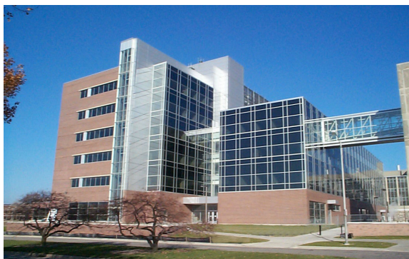
Biomedical and Physical Sciences (BPS) Building, MSU