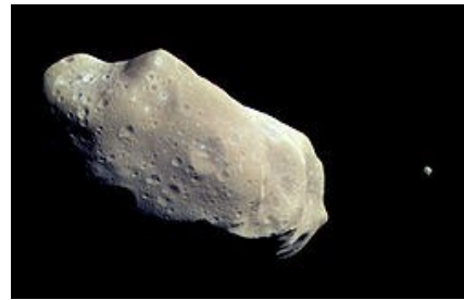
Figure 2 Ida & Dactyl, Galileo, NASA

Since they were part of a larger asteroid, they should have the same composition.