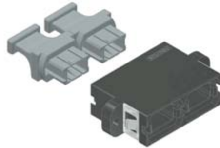
SC Duplex Footprint

*Opposed: Key Option 1, TIA 604-5D *Aligned: Key Option 2, TIA 604-5D