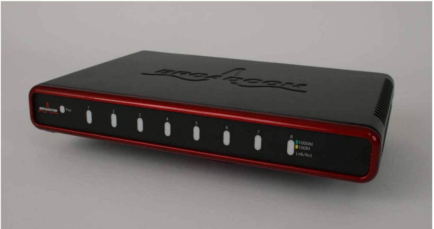
BCM953118R8G (Front View)