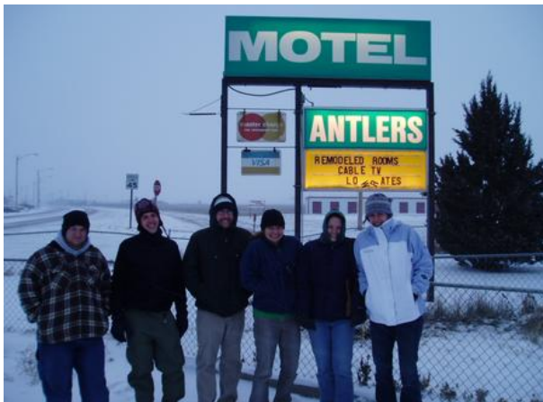
The EWB-MSU Pine Ridge development group outside of their deluxe accommodations in Pine Ridge, S. Dakota.

Engineers and students from all disciplines are welcome