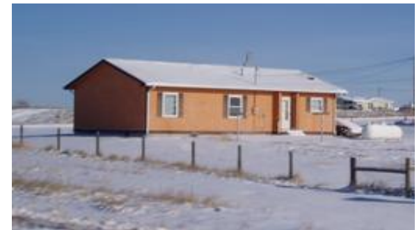
Typical housing unit found on the reservation. Built as part of a HUD program in the 1970's, these pre-fabricated units are now faced with major problems such

Michigan State University Chapter of Engineers Without Borders (EWB-MSU)