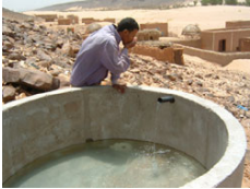
EWB-USA project— Lemraiveq, Mauritania : water well development

The mission of Engineers Without Borders™-USA (EWB-USA) is to partner with disadvantaged communities to improve their quality of life through implementation of environmentally and economically sustainable engineering projects, while developing internationally responsible engineering students.