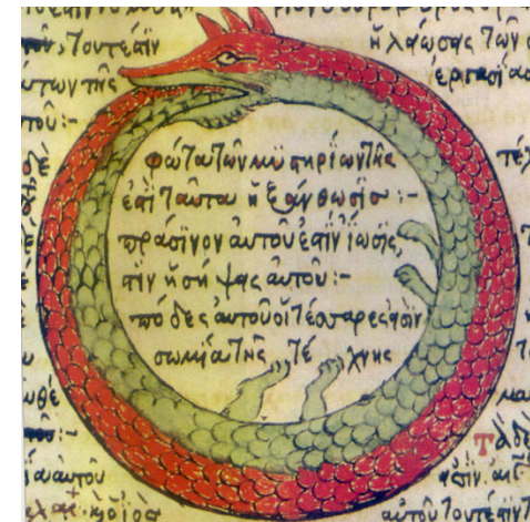
Figure 1.4: Ouroboros

We're currently mounting experiments in both EPP and Cosmology that are going to hit these issues squarely in the next couple of decades. Their results will completely change the way we think. Text-books will be rewritten. If the first 40 years of the twentieth century were wacky, the first couple of decades of the twenty first are likely to be amazing.