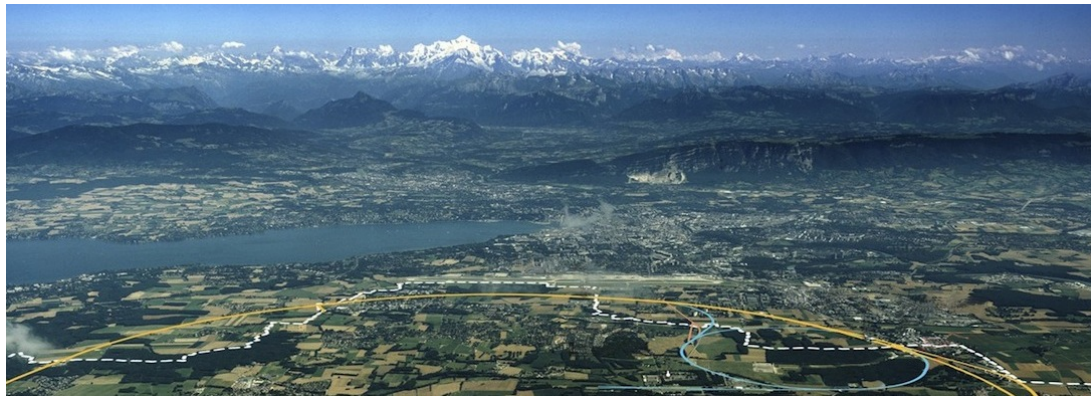
The Large Hadron Collider, looking south across Lake Geneva and the Swiss Alps

“In the beginning, the universe was created. This has made a lot of people very angry and been widely regarded as a bad move.” Douglas Adams