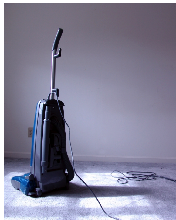
Figure 1.3: vacuum