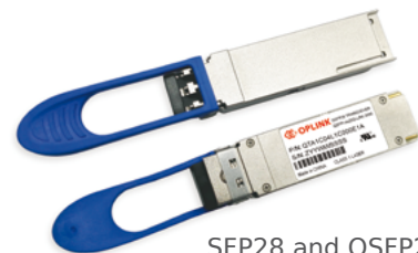
SFP28 and QSFP28 Optical Transceiver